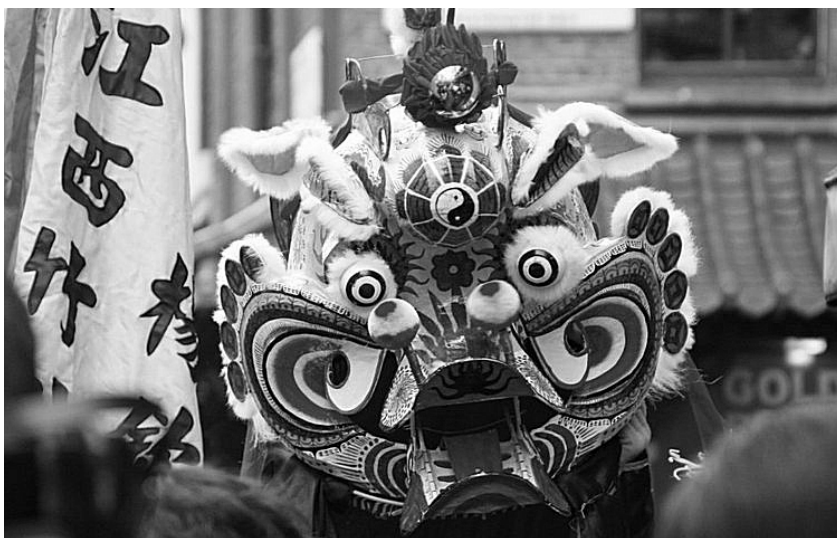
Pig - Chinese New Year